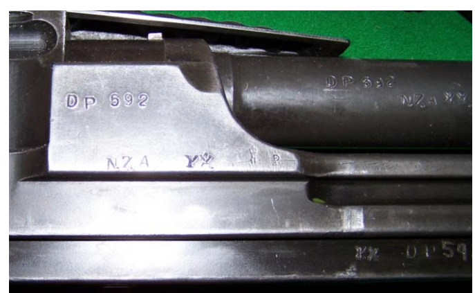
Typical barrel and body marks: "DP 592 NZA"